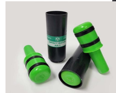
New ARWEN 40mm non-lethal cartridge