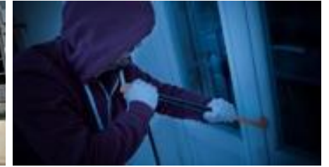
Personal and home defense