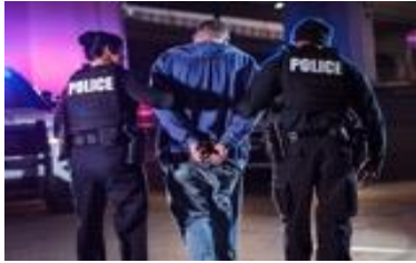
Subjugation of suspects