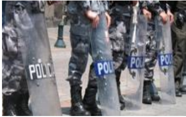
Public order operations