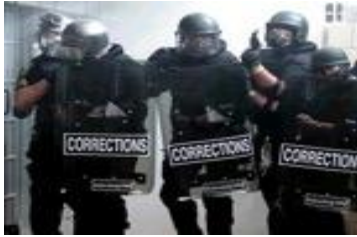
Prison cell extractions