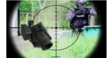
Observation & sniper scopes cameras

SaaS situational awareness offering as a service