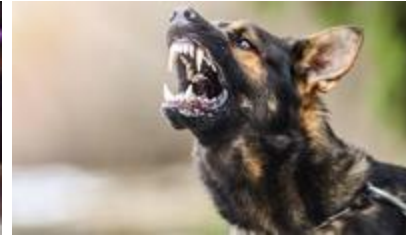
Dangerous animal control